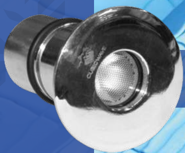
MIRCO FLARE 30